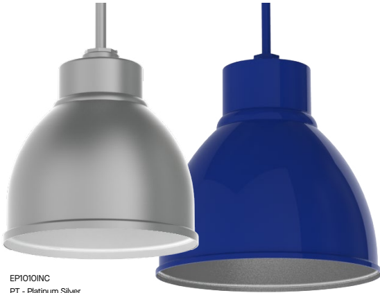
EP1010INC PT - Platinum Silver MWI - Matte White Interior

PROJECT: _____ QUANTITY: _____ TYPE: _____