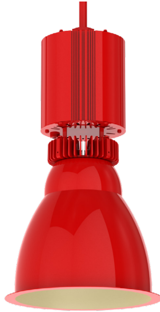
RPEXT1014XT RD - Red Baron ALI - Almond Interior

PROJECT: _____ QUANTITY: _____ TYPE: _____