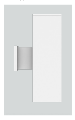
WM WALL MOUNT