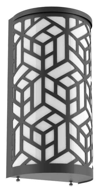
WSC0816FM RWBX- Rubix