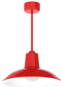
SW1910GV SHOWN WITH RDC5PM