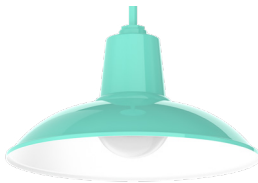
SW1910GV SF - Sea Foam