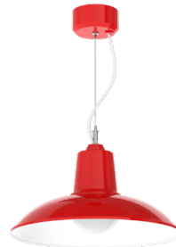
SW1910GV SHOWN WITH RDC5CD