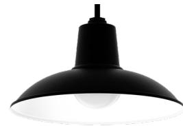
SW1910GV TB - Textured Black