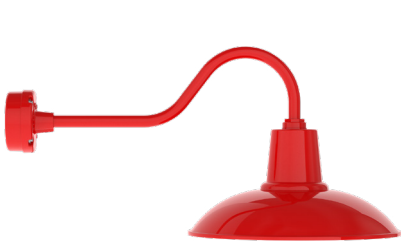
SW1910GV SHOWN WITH CP104PA23