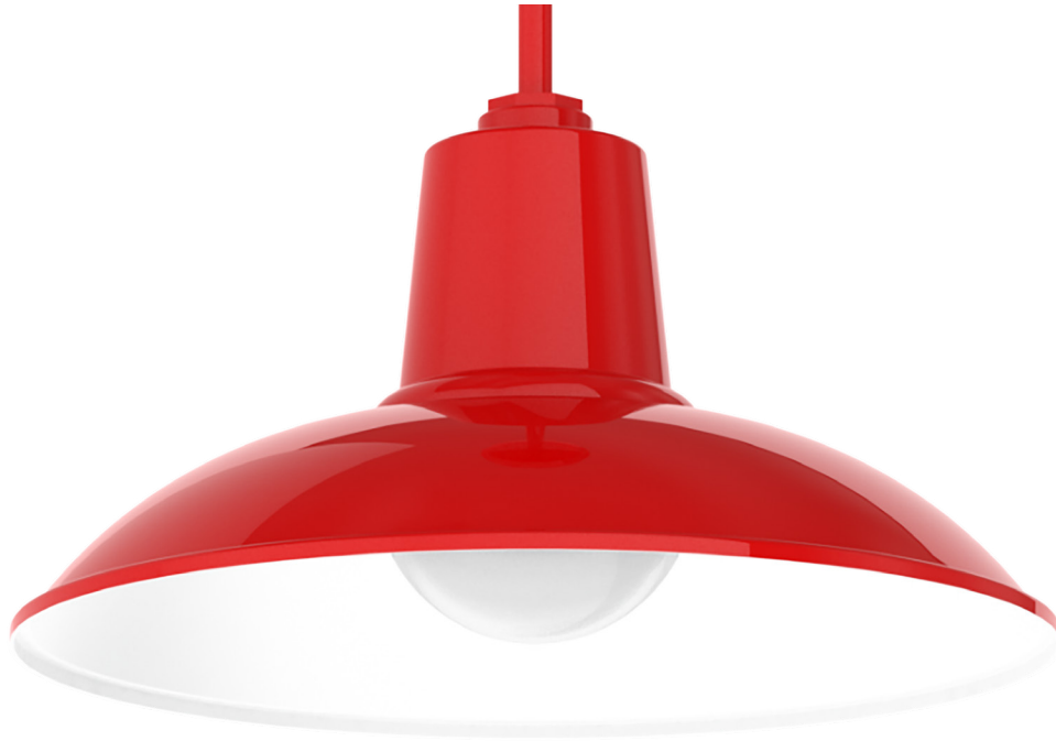
SW1910GV RD - Red Baron

PROJECT: _____ QUANTITY: _____ TYPE: _____