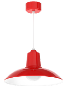
SW1910GV SHOWN WITH RDC5CM