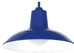
SW1910GV BL - Blue Streak