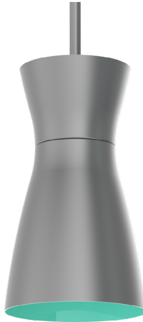
ME0713DGV PT - Platinum Silver SFI - Sea Foam Interior

PROJECT: _____ QUANTITY: _____ TYPE: _____