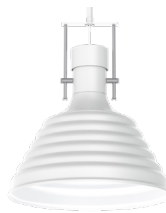
PY1824GV MW - Matte White