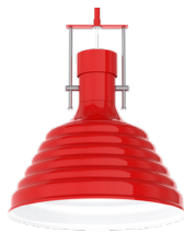
PY1824GV RD - Red Baron