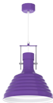
PY1824GV SHOWN WITH RDC5CM