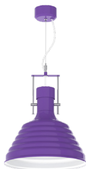
PY1824GV SHOWN WITH RDC5CD