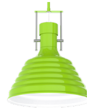
PY1824GV LG - Lime Green