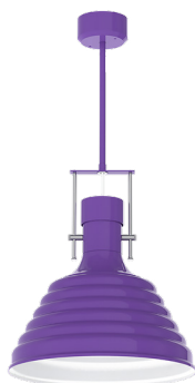
PY1824GV SHOWN WITH RDC5PM