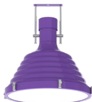
PY1824GV SHOWN WITH DR18CFO