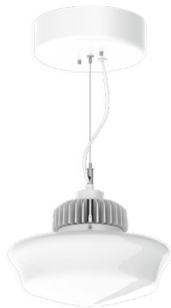
SS16GV SHOWN WITH CP113CD