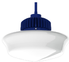
SS16LX BL - Blue Streak