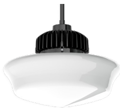
SS16LX GB - Glass Black