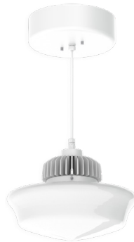
SS16GV SHOWN WITH CP113CM