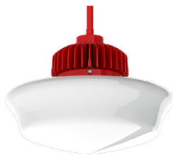
SS16LX RD - Red Baron