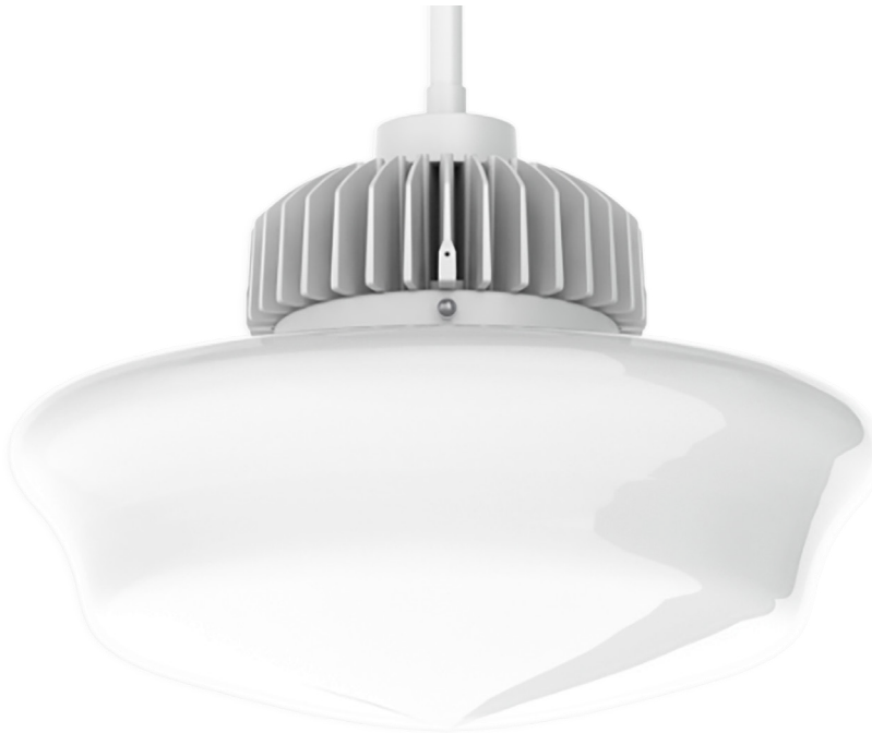
SS16LX MW - Matte White