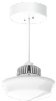
SS16GV SHOWN WITH CP113HM