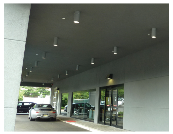
CLOCKWISE FROM LEFT: MERCEDES BENZ IN SPRINGFIELD, MA - AUDI IN COSTA MESA, CA - JACK DANIELS PORSCHE IN UPPER SADDLE RIVER, NJ