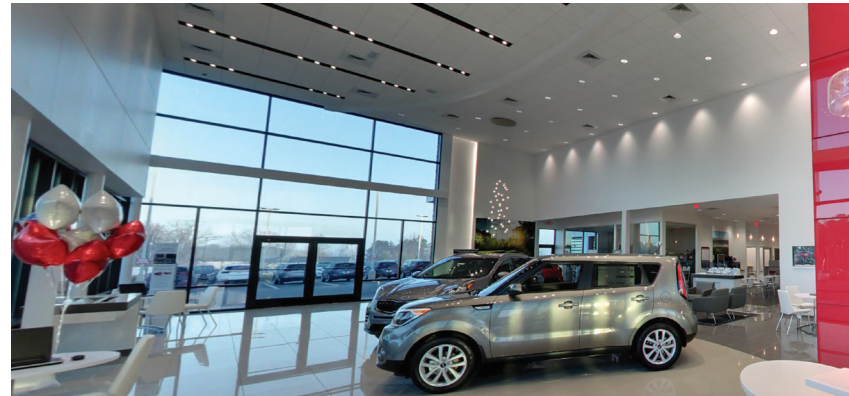
CLOCKWISE FROM LEFT: FERARRI IN LOS ANGELES, CA - BEAVER TOYOTA IN ST. AUGUSTINE, FL - KIA IN MONROE, NC