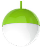
HP1200GV LG - Lime Green