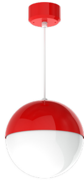
HP1200GV SHOWN WITH RDC5CM