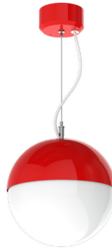
HP1200GV SHOWN WITH RDC5CD