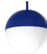
HP1200GV BL - Blue Streak