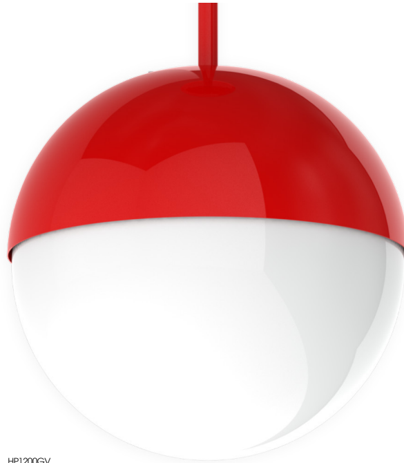
HP1200GV RD - Red Baron