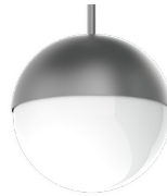
HP1200GV PT - Platinum Silver