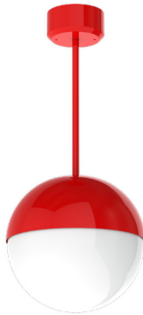
HP1200GV SHOWN WITH RDC5PM

HM / AT / PM HANG STRAIGHT / ALL THREAD / PENDANT