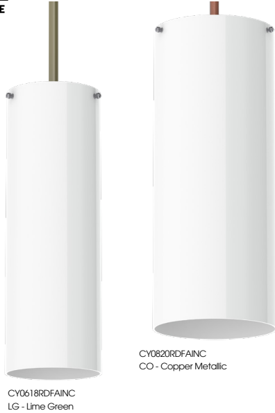
CY0618RDFAINC LG - Lime Green