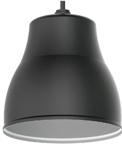
SP1414GV MB - Matte Black MWI - Matte White Interior