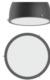
SP1414GV SHOWN WITH DR14BFO