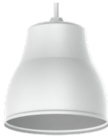
SP1414GV MW - Matte White FCI - Fixture Color Interior