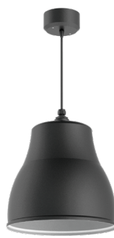
SP1414GV SHOWN WITH RDC5CM