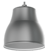
SP1414GV PT - Platinum Silver MWI - Matte White Interior