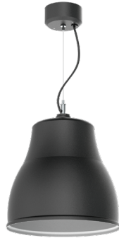
SP1414GV SHOWN WITH RDC5CD