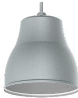
SP1414GV AM - Anodic Malachite MWI - Matte White Interior