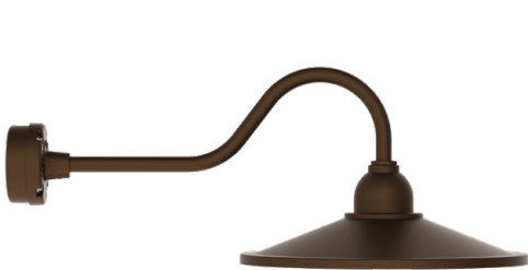
FP1906GV SHOWN WITH CP104PA23