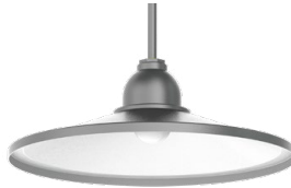
FP1906GV PT - Platinum Silver MWI - Matte White Interior