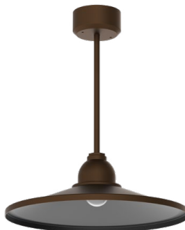
FP1906GV SHOWN WITH RDC5PM

HM / AT / PM HANG STRAIGHT / ALL THREAD / PENDANT