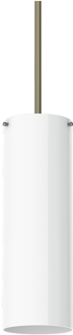
CY0618RDGV AC - Anodic Champagne