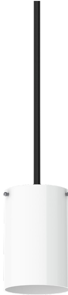
CY0608RDGV AK - Anodic Black