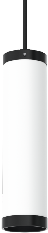
AF0624GV AK - Anodic Black