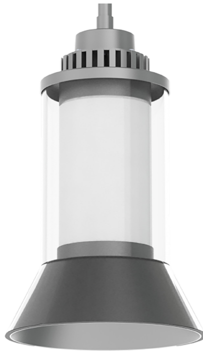
AF0812COAFIAGV PT - Platinum Silver

PROJECT: _____ QUANTITY: _____ TYPE: _____