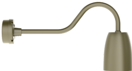
BU40GV SHOWN WITH CP104PA23