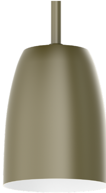
BU40GV AC - Anodic Champagne MWI - Matte White Interior