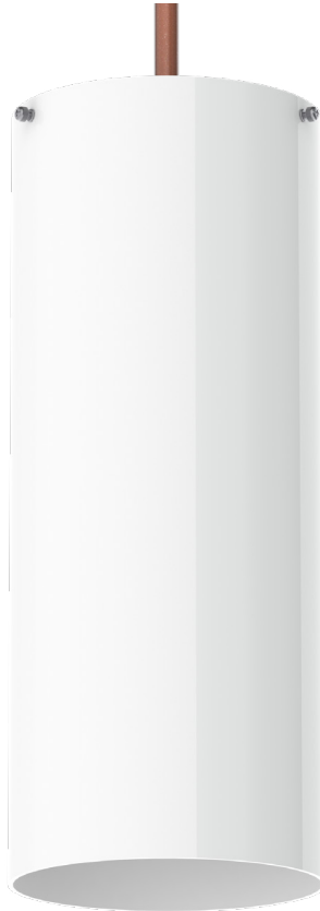
CY0820RDGV CO - Copper Metallic