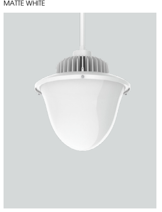
MW MATTE WHITE