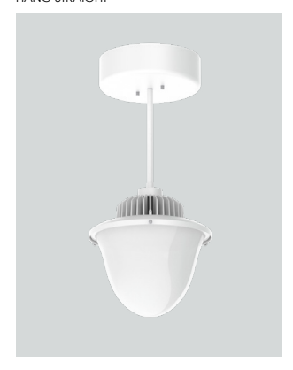
HM HANG STRAIGHT