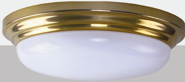
PB -Polished Brass