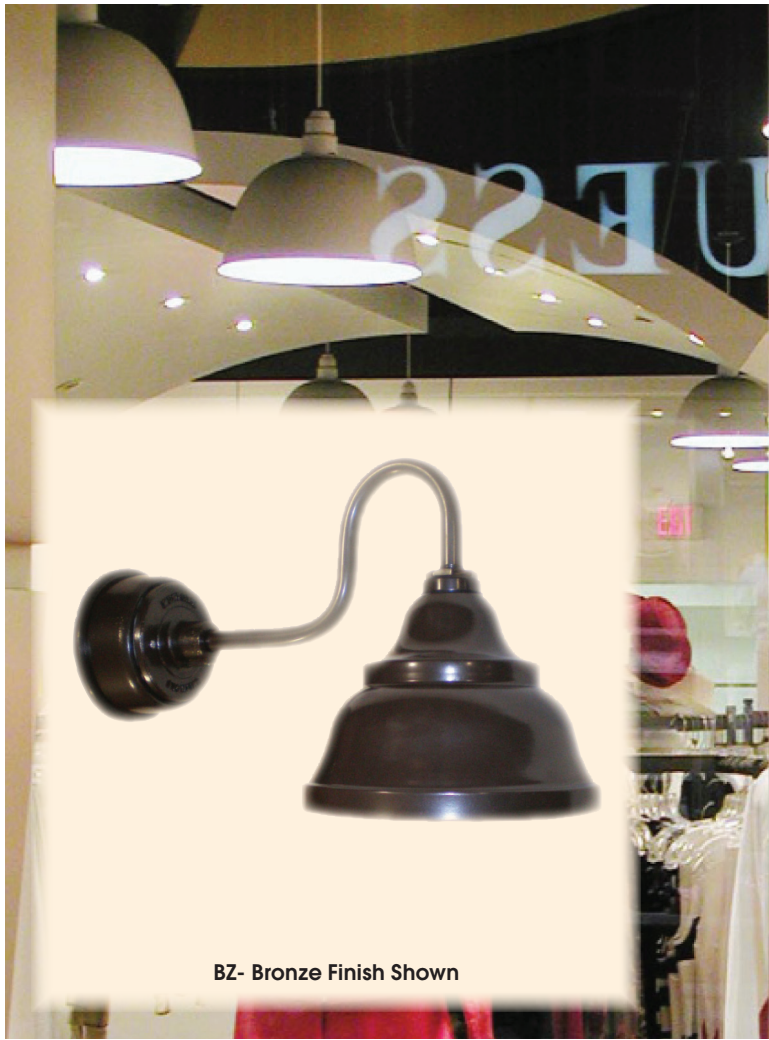
BZ- Bronze Finish Shown