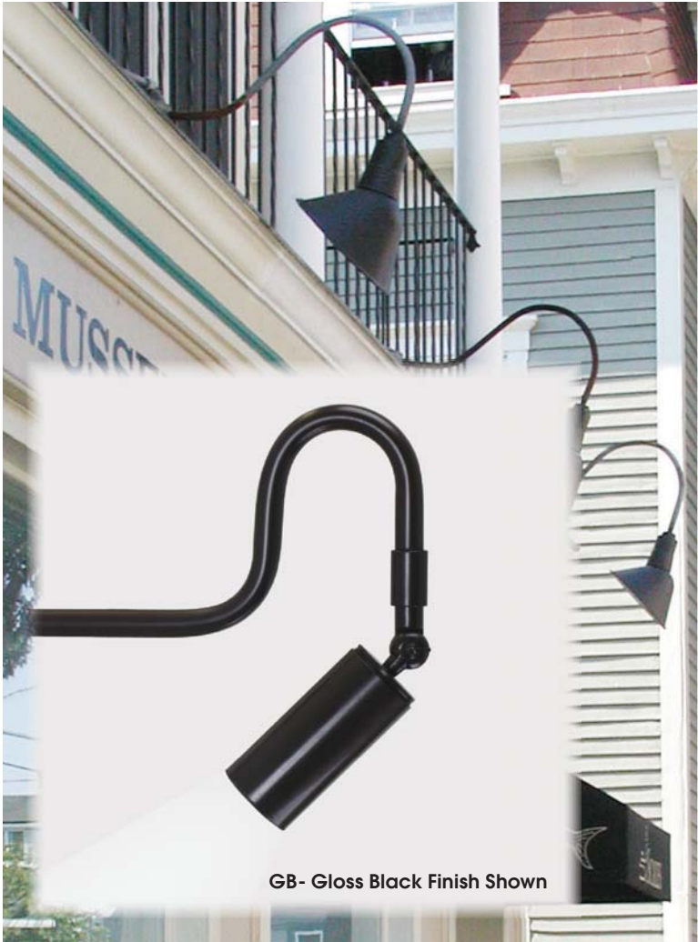
GB- Gloss Black Finish Shown