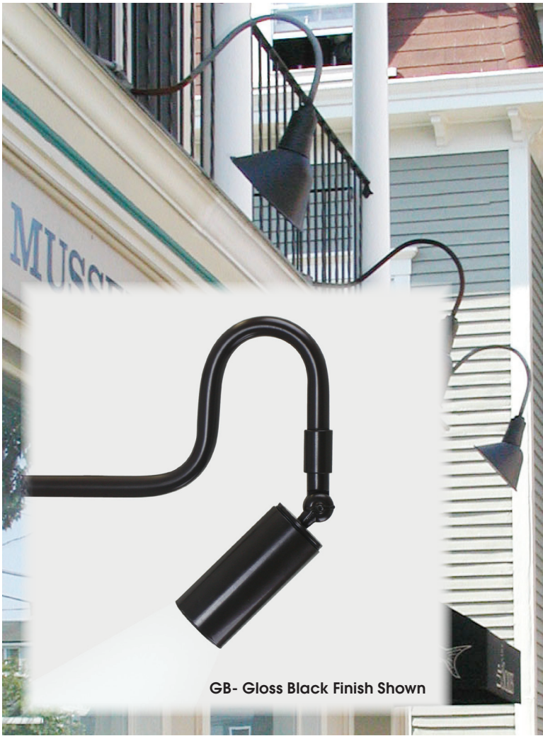
GB- Gloss Black Finish Shown