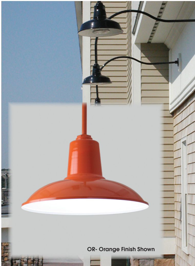
OR- Orange Finish Shown