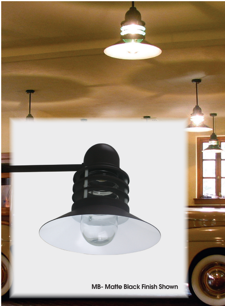
MB- Matte Black Finish Shown