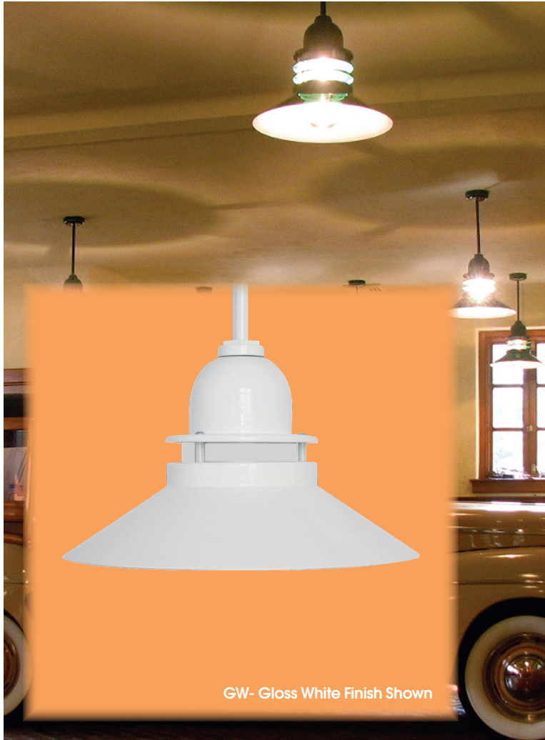
GW- Gloss White Finish Shown