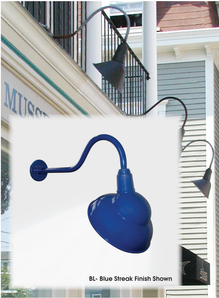
BL- Blue Streak Finish Shown