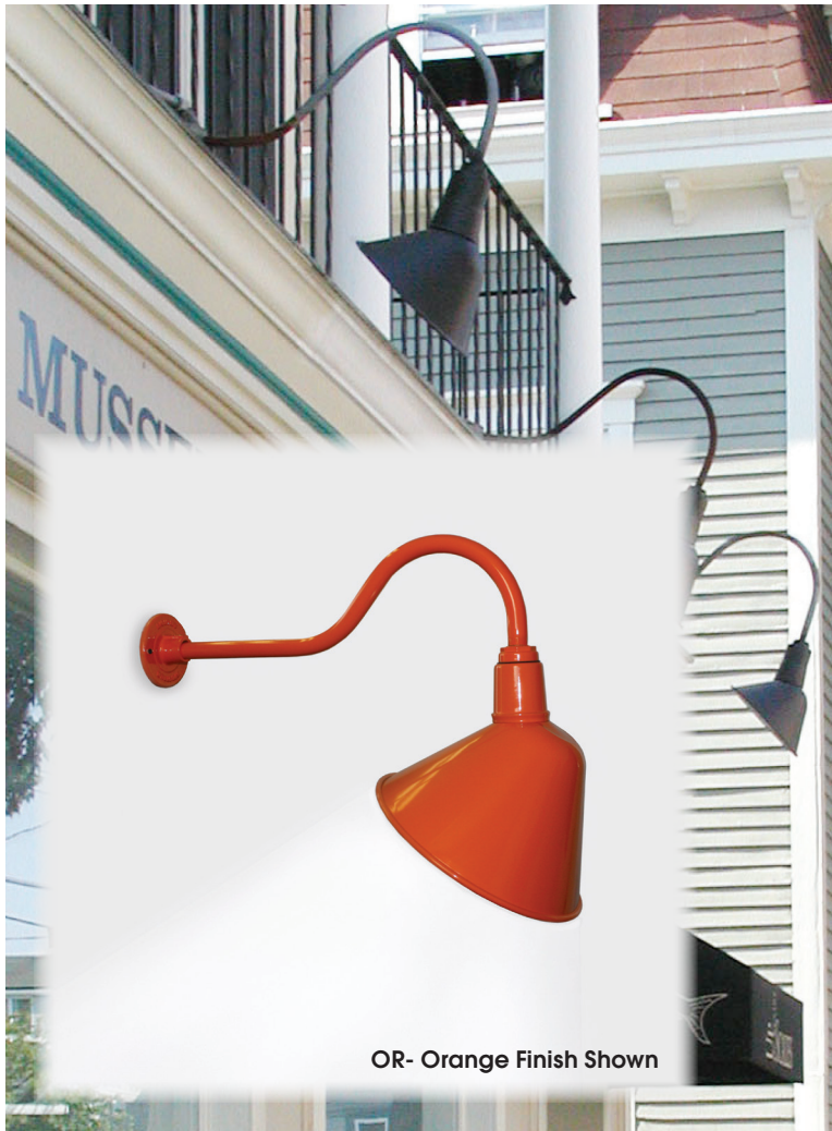
OR- Orange Finish Shown