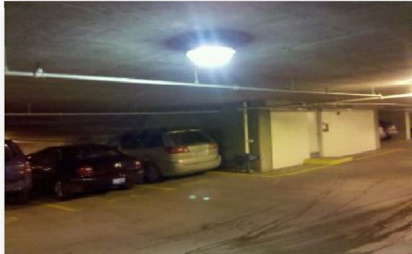
Spectrum Lighting 63w LED Canopy Fixture