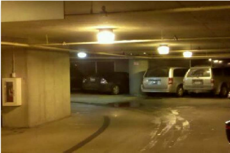
150w High Pressure Sodium Canopy Fixtures