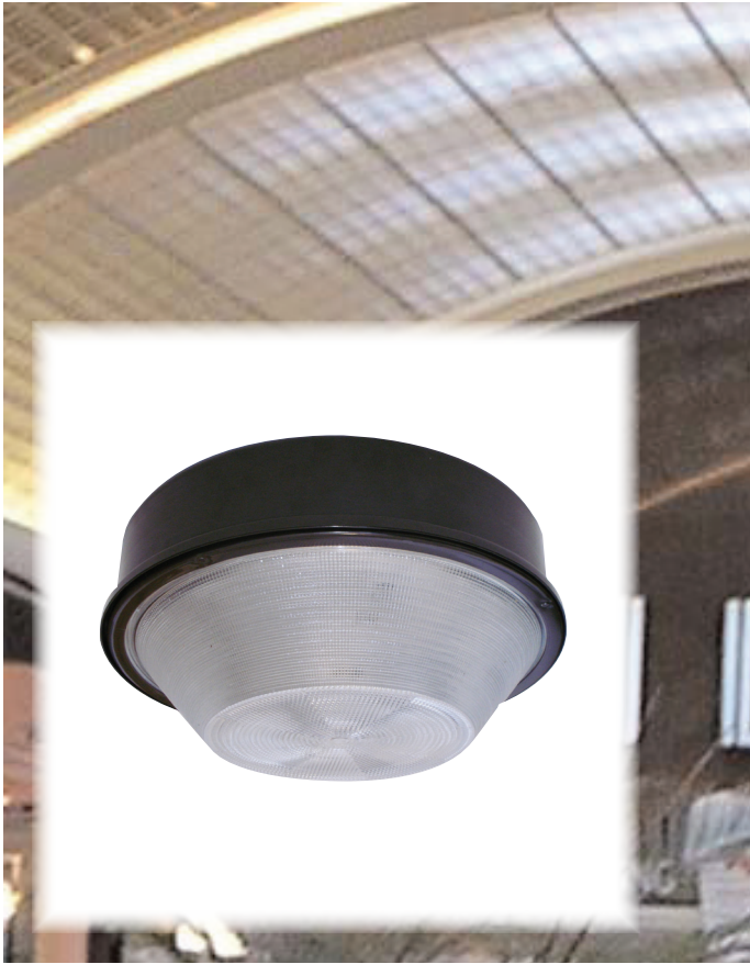
HMI1707CF AREA FIXTURE