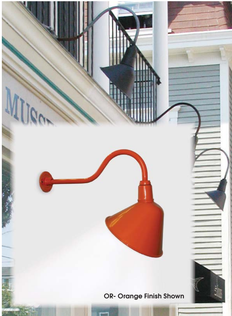
OR- Orange Finish Shown