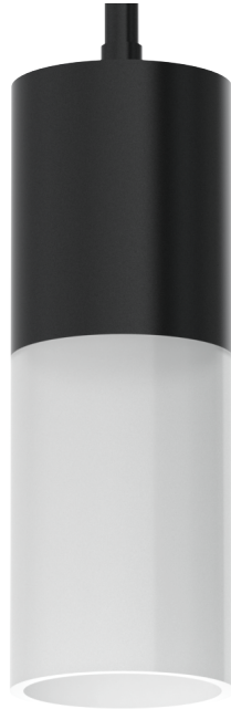
CY0405DXT FACY6 - 6" Frosted Clear Acrylic AB - Anodic Black