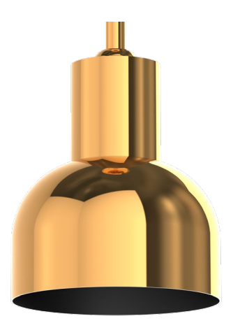
BARISTA - 1500 LM ET60GV - 6.5" x 7.9"