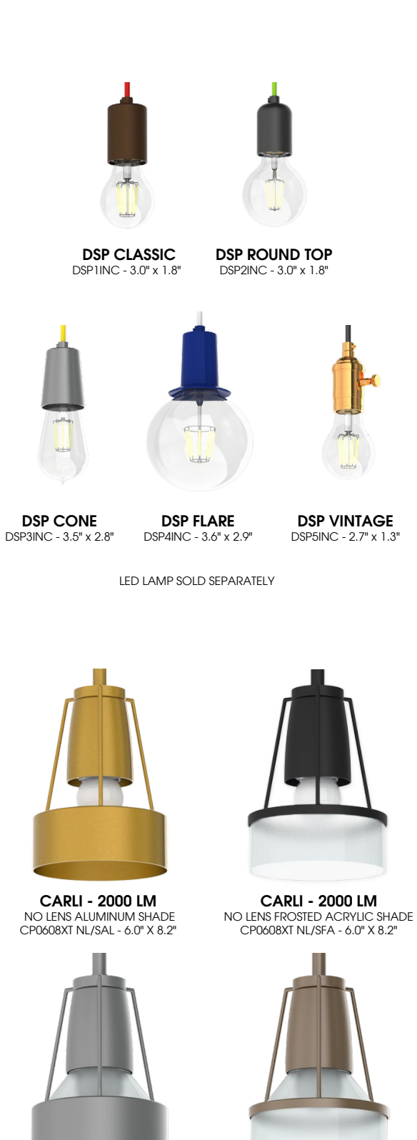
CARLI - 2000 LM FROSTED ACRYLIC DIFFUSER ALUMINUM SHADE CP0608XT FA/SAL - 6.0" X 8.2"