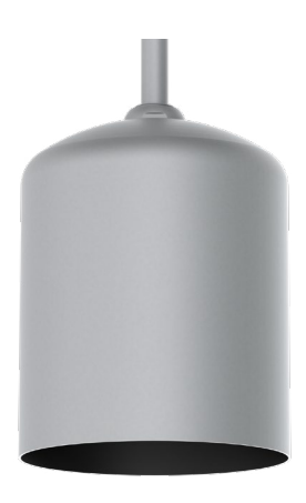
CORTADO - 1500 LM RB70GV - 6.1" x 8.1"

CAPPUCCINO - 1500 LM BU40GV - 6.4" x 8.7"