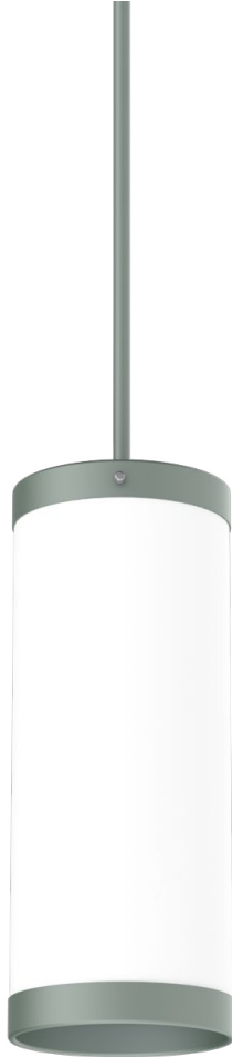
AF0820GV AM - Anodic Malachite