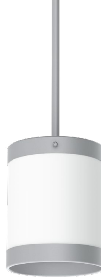
AF0810GV AN - Anodic Natural