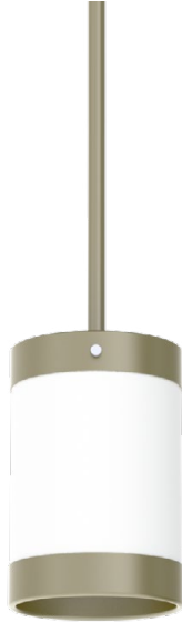
AF0609GV AC - Anodic Champagne