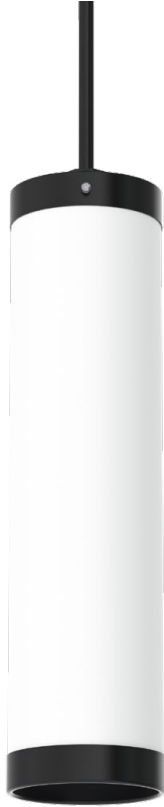
AF0624GV AK - Anodic Black