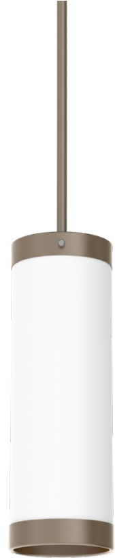
AF0618GV AZ - Anodic Bronze