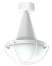
BL1317GV SHOWN WITH SM