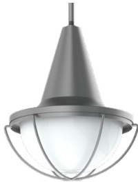
BL1317GV PT - Platinum Silver