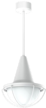
BL1317GV SHOWN WITH RDC5PM