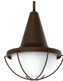
BL1317GV BZ - Bronze