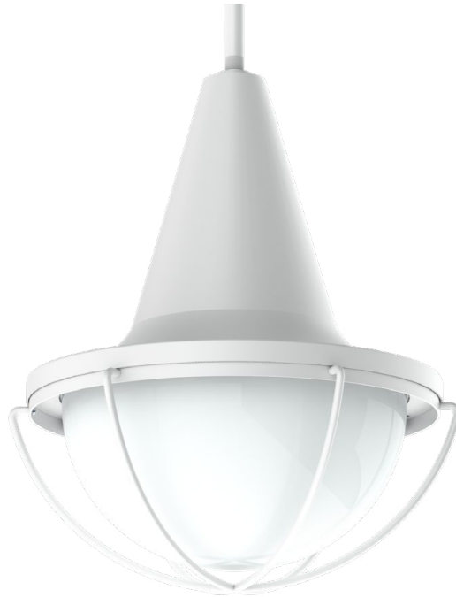
BL1317GV MW - Matte White

PROJECT: _____ QUANTITY: _____ TYPE: _____