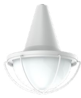
BL1317GV SHOWN WITH FGG