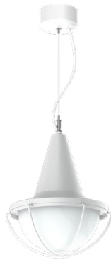
BL1317GV SHOWN WITH RDC5CD