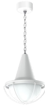
BL1317GV SHOWN WITH RDC5CHN