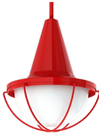
BL1317GV RD - Red Baron