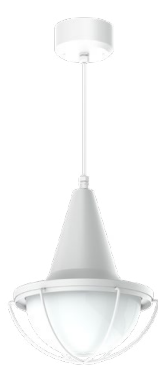
BL1317GV SHOWN WITH RDC5CM