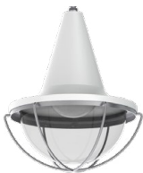
BL1317GV SHOWN WITH CGG